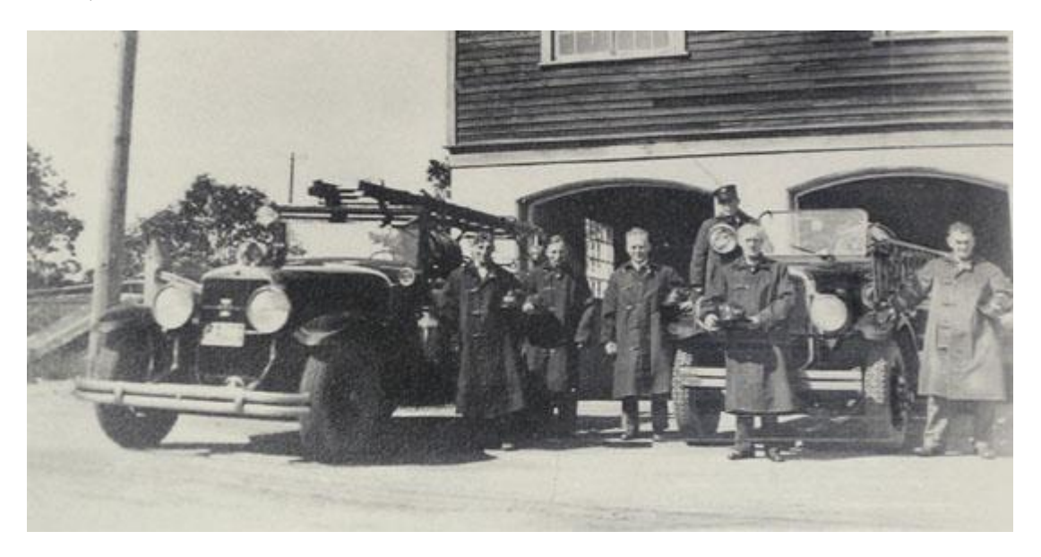
1926 Cadillac and 1929 GMC La France outside Saanich Fire Station No., 1, 3681 Douglas Street.

In 1947, we built a second fire station at Royal Oak and in 1950, built a third station in Gordon Head. The Department responded to 286 calls per year and had a budget of $101,950.59.