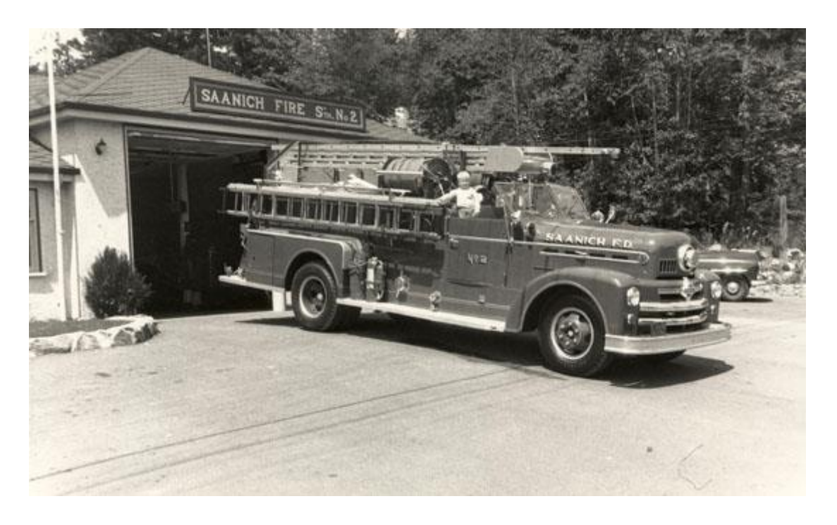
Saanich Fire Hall No. 2, Hamsterly Road 196-.

The big changes in the 1960s consisted mainly of introducing an ambulance service and acquiring new pumpers. Saanich also opened our present No. 1 Fire Station, putting police and fire departments under one roof. We bought a new La France quad pumper in 1965 and a new La France triple combination tanker in 1969.